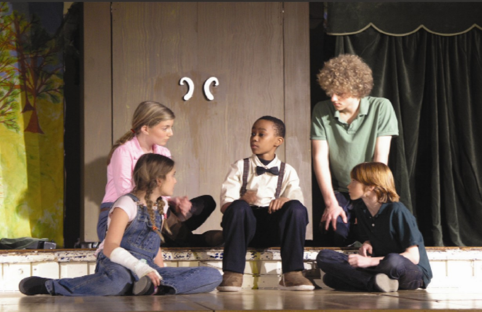
Drama production of: The Lion, The Witch & the Wardrobe